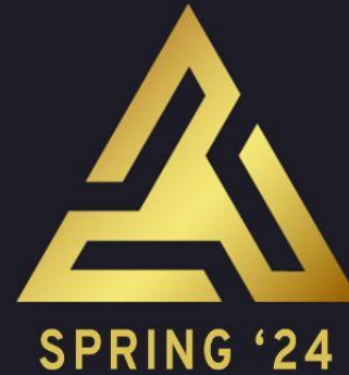
An exclusive champion badge