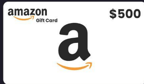
A $500 USD Amazon gift card

Winners will be announced at the Closing Ceremony on May 2nd. Each qualified member on the winning team will receive: